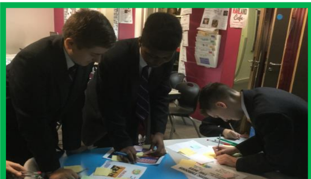
Students peer-assessing in Music

Students are involved in the process and are encouraged to take part ownership of this process.